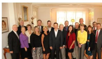
Volunteer members of the Minnesota Military Family Tribute