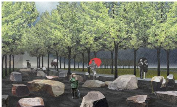
Left: Story Stones