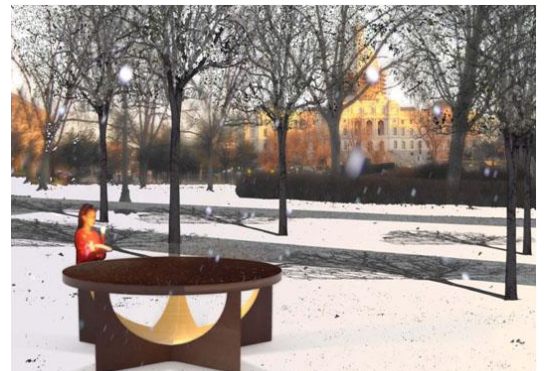
Below: Thank You Military and Veteran Family Walkway