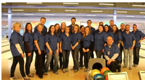
Team Popp Communications