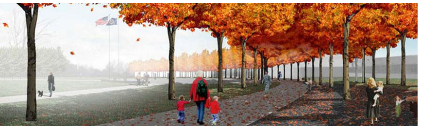
*Artists sketches are preliminary drafts of the Tribute design. Final design concept is subject to the approval of the MNCAP Board.